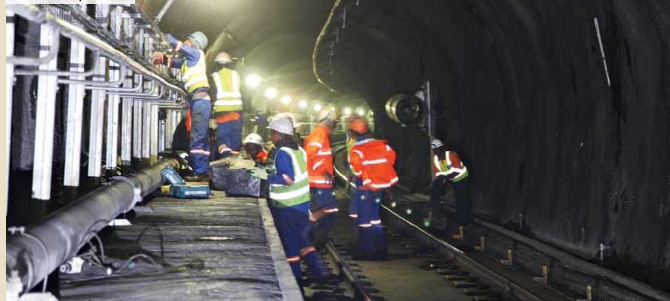
The Gautrain rapid rail link.