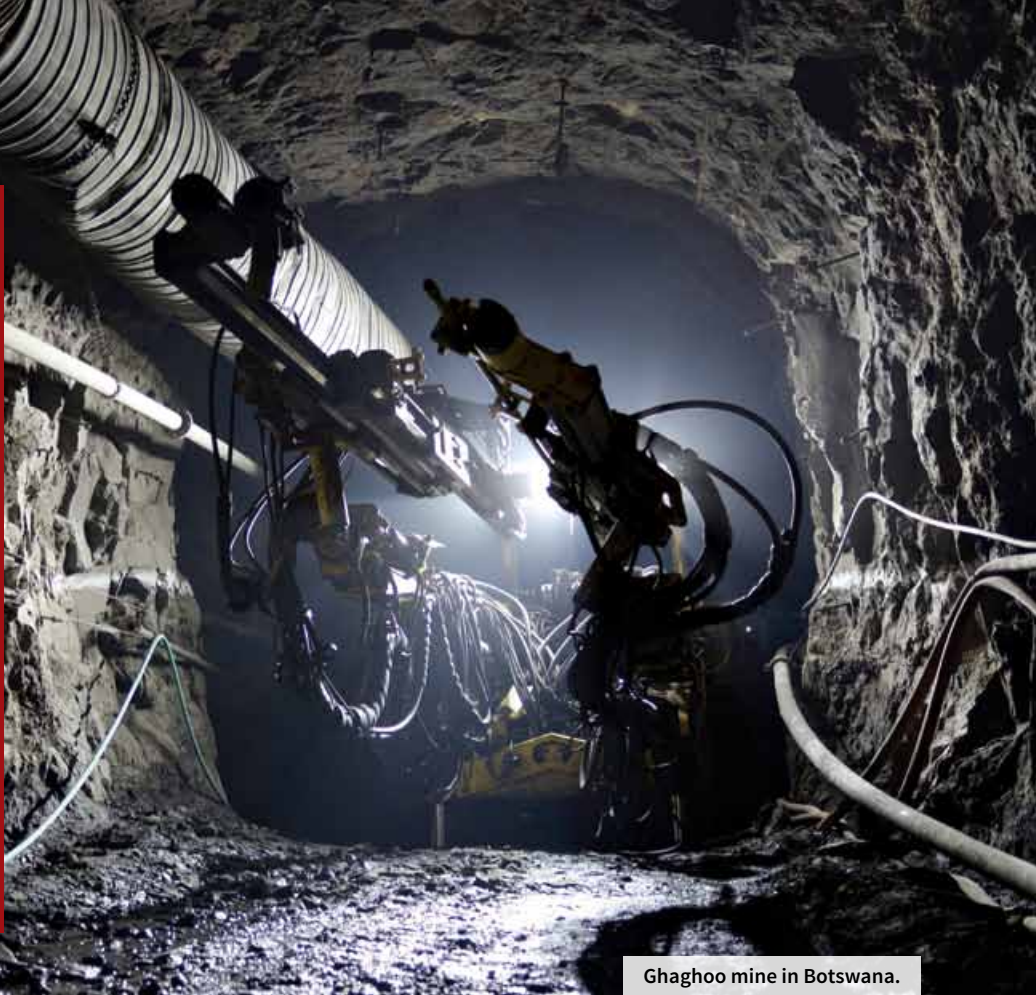
Ghaghoo mine in Botswana.

“The company is already receiving numerous enquiries for its patented chemical sealing products, which have been used successfully in a number of local and African mining operations.”